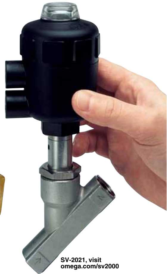
SV-2021, visit omega.com/sv2000