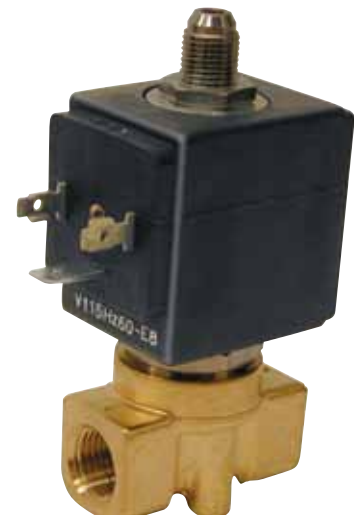
SV4100 visit omega.com/sv4100_sv4300