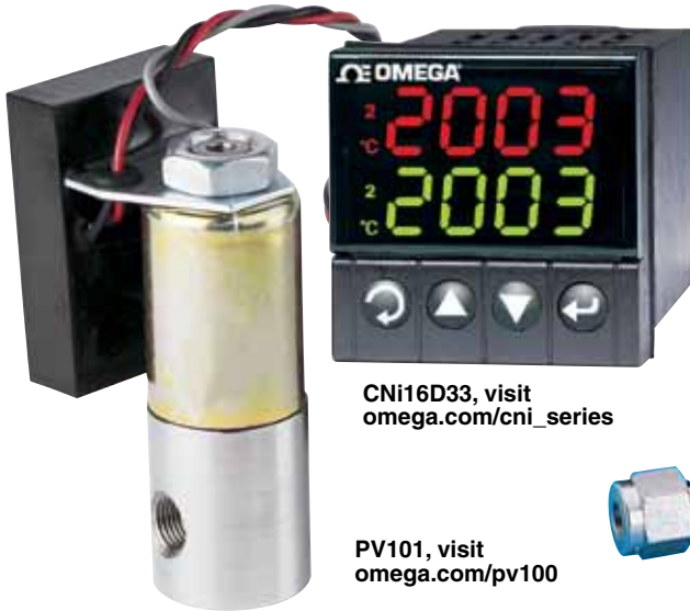
CNI16D33, visit omega.com/cni_series