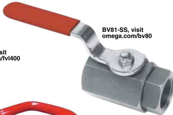
BV81-SS, visit omega.com/bv80