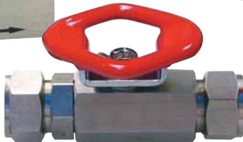
BV71-SS, visit omega.com/bv70