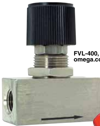
FVL-400, visit omega.com/fvl400