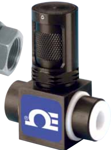
FVLT100, visit omega.com/fvlt100