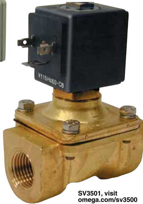
SV3501, visit omega.com/sv3500