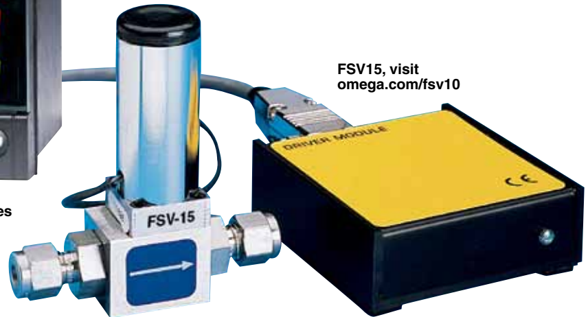
FSV15, visit omega.com/fsv10