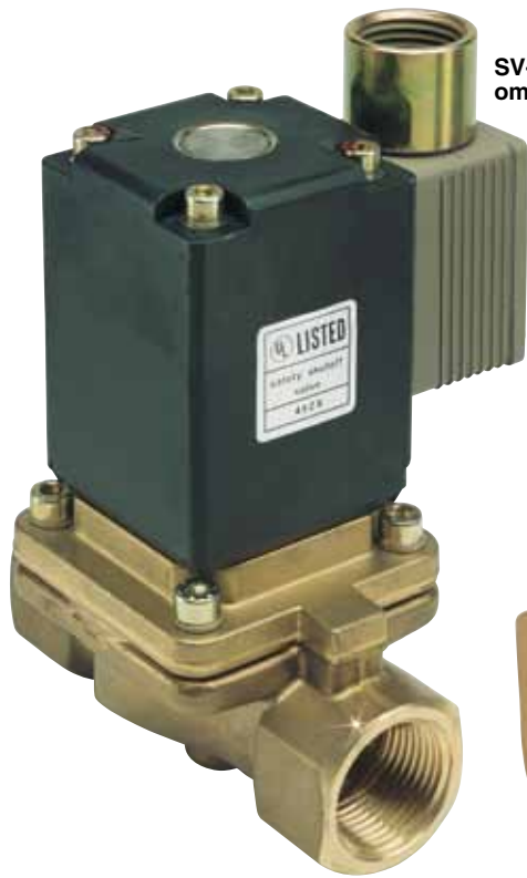
SV-351, visit omega.com/sv350