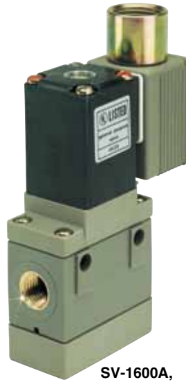
SV-1600A, visit omega.com/sv1600